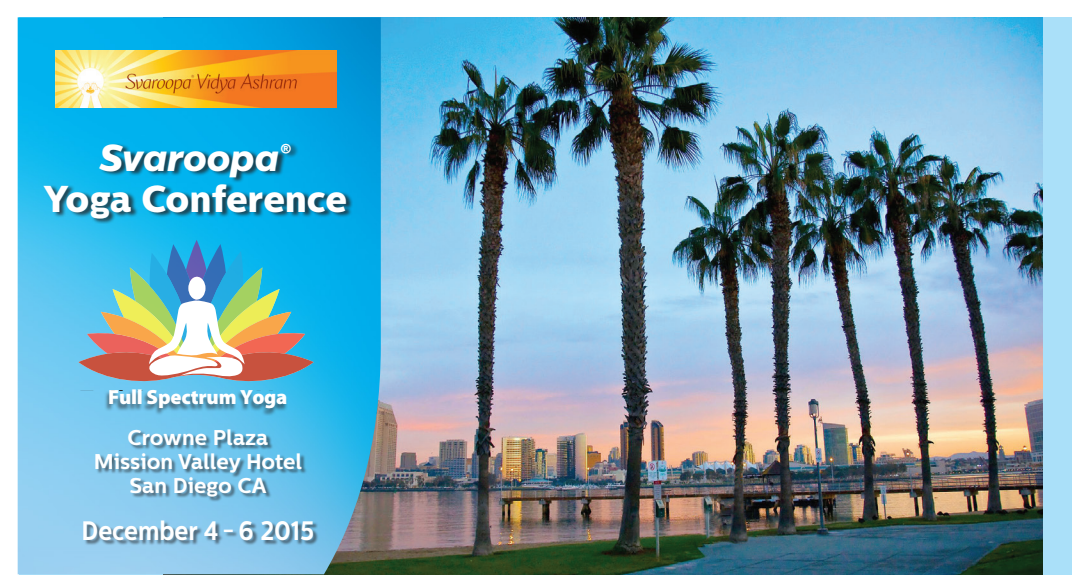
Celebrate with us the breadth and depth of the Svaroopa® sciences. Deepen your yoga experience. Find within yourself what you really seek, while benefitting from the company of other deeply practicing yogis.